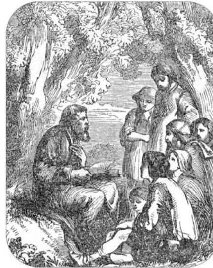
Peter Waldo teaching

to the people of France! Still, it could not be distributed to very many people, because the printing press had not yet been invented. Each copy had to be handwritten! This took many long hours, and that meant that a complete copy of the Bible was very expensive. Most people could not afford this, but Waldo was so eager to teach the people the way of salvation that he freely gave away many copies of the New Testament and separate books of the Bible. Many people read the Bible for the first time in their lives because of his efforts.