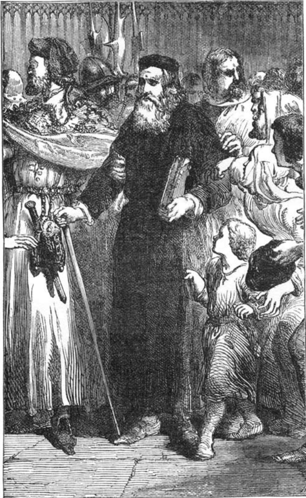
Wycliffe and the Lollards

to hym / lord i haue no man that whanne the watir is moued to putte me in to the cisterne / for the while i come / another goith doun bifor me / ihesus seith to hym / rise up / take thi bed and go / and anoon the man was made hool / and tooke up his bedde and wente forth / and it was saboth in that dai /