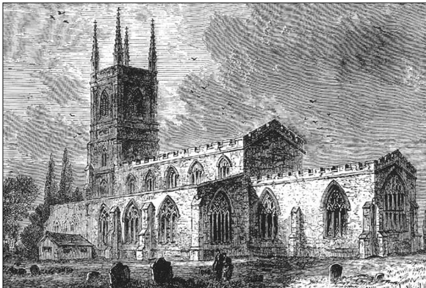
The church at Lutterworth

all over the country, preaching the gospel in churchyards, at fairs, in marketplaces, in the streets, and wherever they could get people to come and hear them. Sometimes these men were called Lollards. In 1401, the Lollards were condemned by the pope as heretics, and some were burned at the stake.