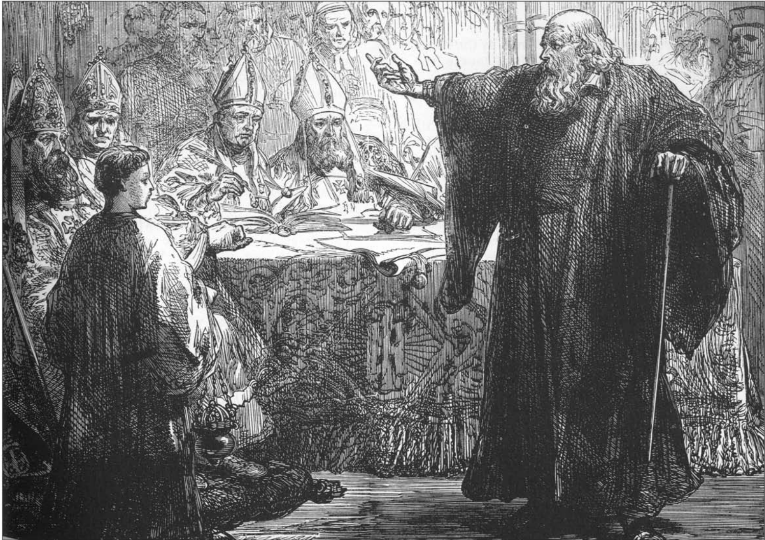
Wycliffe tried at Oxford