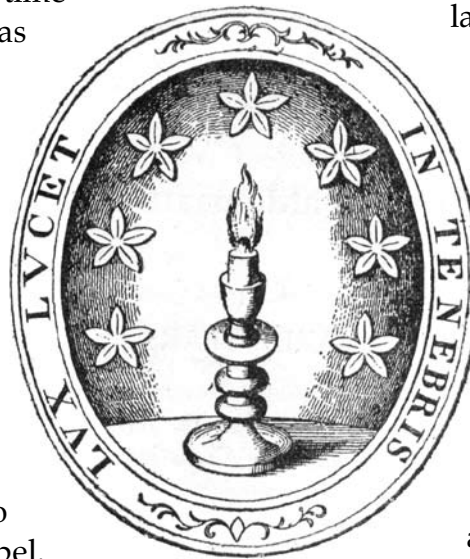
The Waldensian Seal

official gatherings, similar to what we would call a synod or an assembly. At that gathering, they adopted a new Confession of Faith, which included the doctrine of predestination. They also cut all ties with the Roman Catholic Church and decided that ministers could marry.